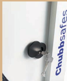
a) 8-lever double bitted Key Lock only, certification under UL 437. Furniture Projection: 27mm