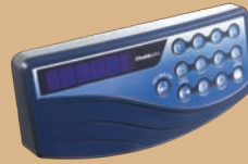
Electronic Lock Furniture Projection: 30mm