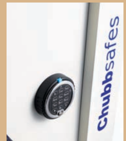
c) Z03 Digital Combination Lock, listed under UL Type 1. (Power Source 1 unit of 9V size battery) Furniture Projection: 38mm