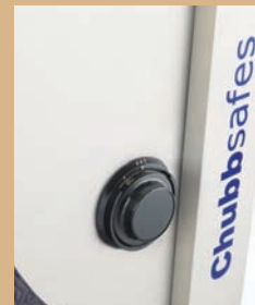
b) 3-wheel Keyless Combination Lock only, listed under UL Group 2. Furniture Projection: 30mm