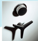
Keyless Combination Lock